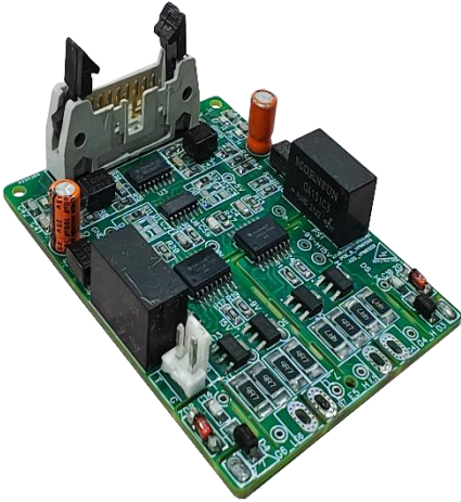
DUAL SIC DIFFERENTIAL INPUT DRIVER ( \pm 15A )